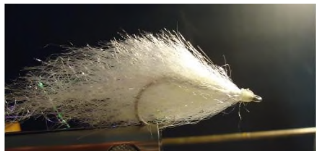
Alan used Mirror Image fiber for this fly but he has used other fiber material as well with equal success.