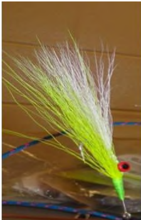
Capt. Dan ties his modified Clouser in chartreuse and white but also in white-white.

Step. 2. Attach a set of medium barbell eyes just ahead of the hook point. Apply tying cement to the wraps and eyes.