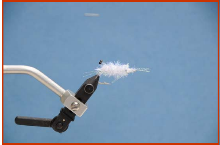
Springer's Crystal Shrimp: tied & photographed by Al Pitcher

Step 3: Tie in several strands of Krystal Flash about 3" long at the rear of the hook with about 1/2" to 1" of strands going past the bend of the hook.