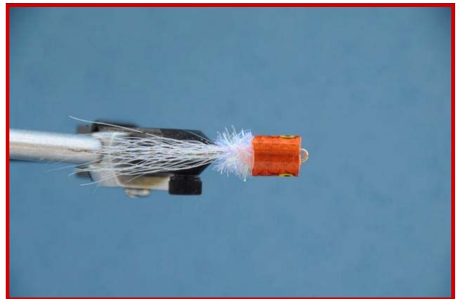
Baby Banger—tied and photographed by Al Pitcher Top: side view, Bottom: top view