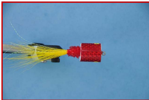
Bob's Bangers—Tied and photographed by Al Pitcher Top: side view, Bottom: top view