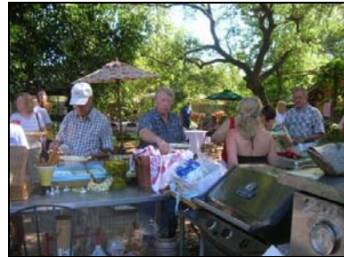
"Fellers" going back for seconds