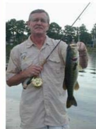
"Never trust a man who doesn't fish" (Teddy Roosevelt)