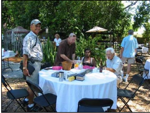
The Prez at the Welcoming Table