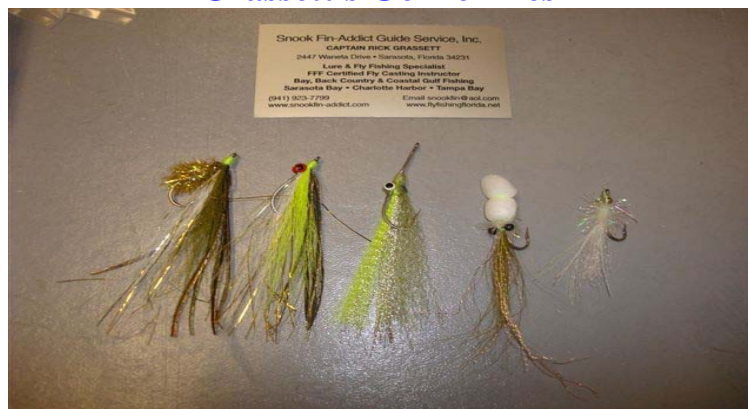
The numbers correspond to the five flies above numbering left to right.