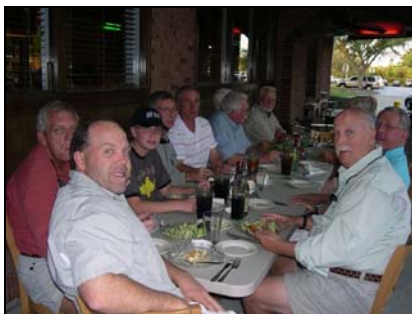
Dinner at Grumpy Dicks