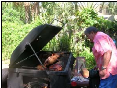
Checking the roasting hog