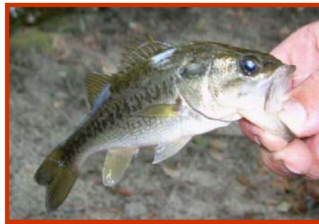
Alligator Creek and typical bass

A typical fish would be something like this. First find a place that looks fishy. Next, look for movement. Once you see the movement, figure out how you're going to cast to the fish. Bass aren't like trout in that they're not as excitable. Stuff that would send a trout running up or down stream will just make a bass move away then turn around to look, "What was that?" Maybe bass are just dumb.