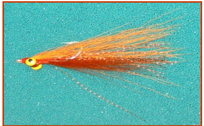
Orange & Brown Clouser Deep Minnow

Note: When fishing with sink tip or intermediate lines as described in Capt. Pat’s excellent article on the previous page, and depending upon water depth, you can very often get down deep enough using an unweighted fly. A good choice would be an orange & brown bendback (with or without a body wrap) as depicted opposite. Tying procedure was described in the On The Fly, Fly Tying Bench, Dec. 2006, Carl’s Glass Minnow.