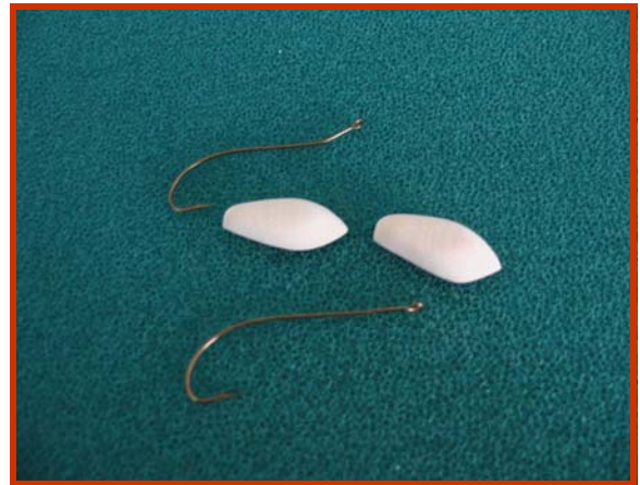
Central Draught hook before and after straightening with foam body halves.

Nothing in the Mustad catalog seemed right but then I noticed what they call a “central draught” hook which is close to what I was looking for except for a “bent back” kink a quarter shank or so back from the eye. The size designation is also different with a size 24 correlating with a regular 1/0 hook, etc. Since that kink could be straight-