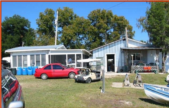
Lake Pasadena Headquarters