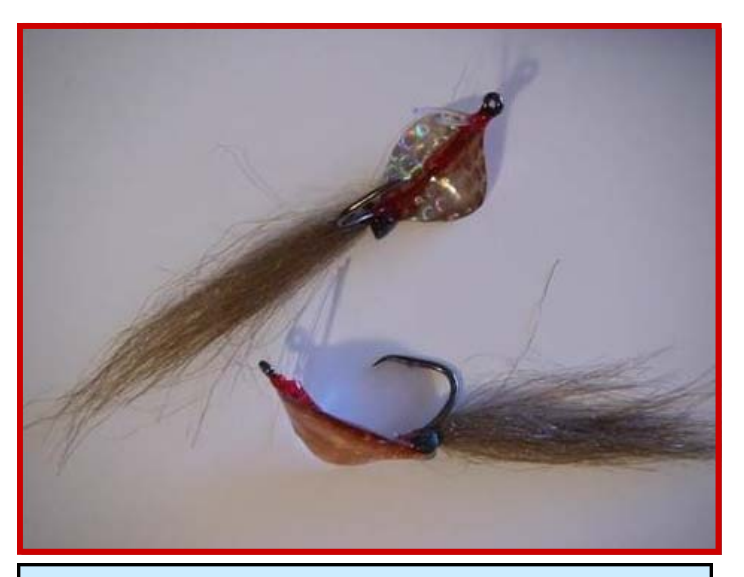
FLA Spoon Fly: Text, photo and drawings by Bob Burns