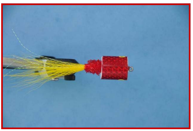
Bob's Bangers—Tied and photographed by Al Pitcher Top: side view, Bottom: top view