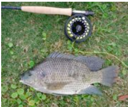
Andy's blob fly tilapia from a neighborhood pond

Back in the states, Andy caught a five-pound bass (alas, no photo), a ¾-lb tilapia caught on a blob fly in a l large pond, and a turtle. Yes, a turtle.