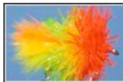
Blob fly. Image and tying instructions courtesy of at Diptera.co.uk