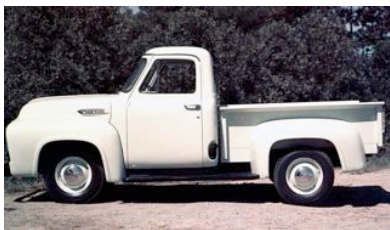
Best accessory for your kayak

No perfect world, but being outdoors fly-fishing in a kayak is as close to nature and fish as you can get. It's good exercise and far less expensive than powerboating.