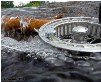
Reckenwald and Scalley fished with 4 and 5 weight rods and line.