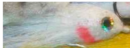
Morrison's snook attacked this fly.