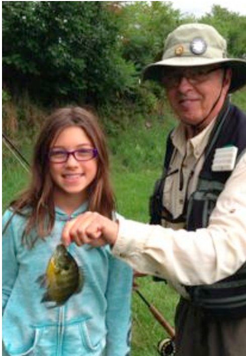
Grin #1: Fishing with his granddaughter on a Pennsylvania farm pond