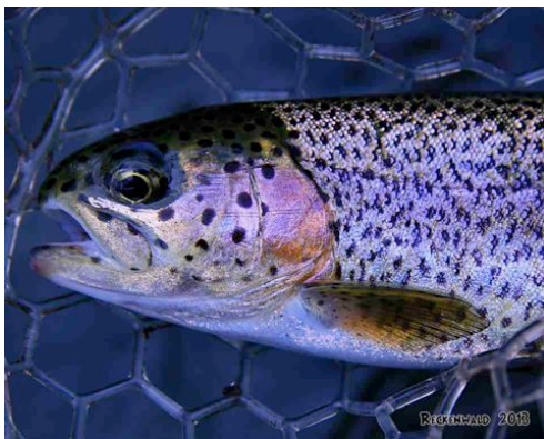
Chattahoochee tailwater rainbow trout