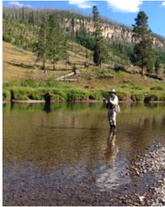
Grin #2: Landing a cutthroat in the Montana mountains.